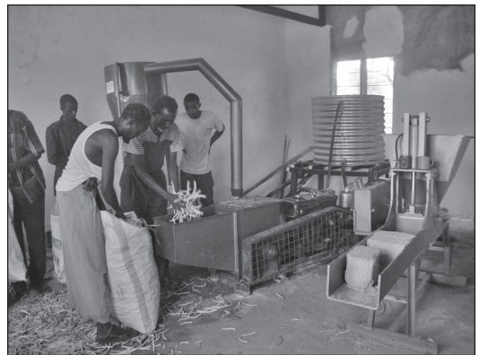
Prosopis beans from field to food. Top left: typical form of young prosopis trees and shrubs, here invading native acacia stands (Djibouti); top right: women carrying one day's collection of beans to a central storage point for sale (Djibouti); bottom left: beans laid out for sun-drying, and removal of diseased and damaged pods (Kenya); bottom right: beans being milled in a small cereal mill, and flour being made into feed blocks for livestock (Kenya)