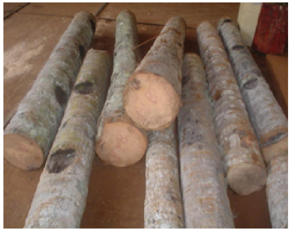
Figure 1: Cocos nucifera logs

Since the coconut log diameter is small -25-30 cm in diameter (Figure 1) with very high density on its periphery, the saw tends to go out of the saw line and a conventional saw easily becomes blunt. The butt portion of the coconut stem is likely to cause sawing difficulties particularly in a large diameter saw. In addition, considerable amount of fine substances similar to sand granules and pieces of small pebbles is present in the bark which contributes to the rapid dulling of saw teeth during sawing operation. For these reasons, it is necessary to apply hard facing materials on the saw teeth.