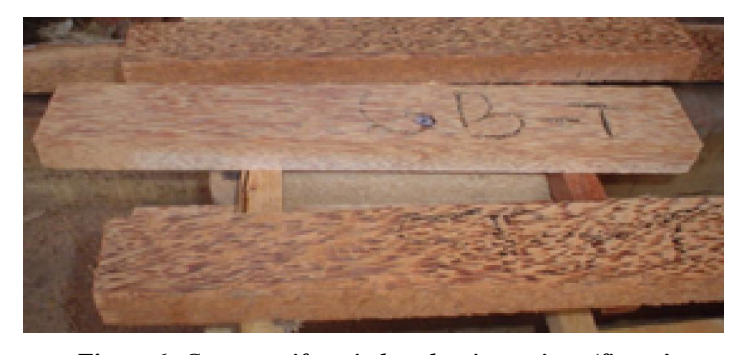
Figure 6: Cocos nucifera timber showing unique 'figure'

The gross structure comprises of extremely soft tissues (parenchyma) alternating with extremely dense (vascular bundles) tissue thus giving a aesthetically beautiful 'figure' as shown on Figure 6.