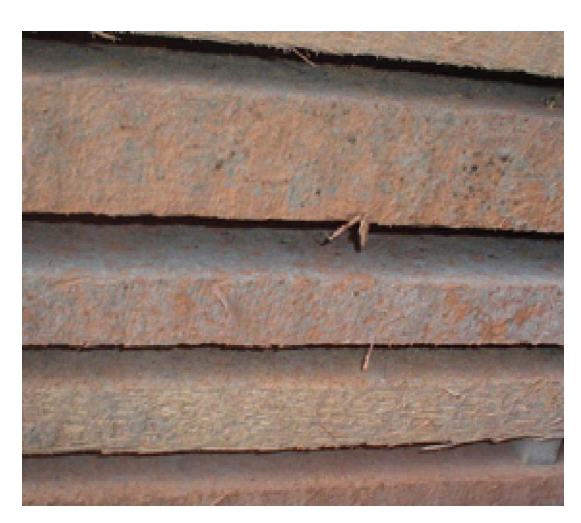
Figure 3: Mould on the Cocos nucifera drying timber