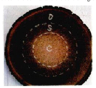
Figure 5: Cross-section of Cocos nucifera trunk (D- Dermal, S-sub-dermal, C- Central zone or core)

Unlike conventional trees coconut palms being monocotyledon has no vascular cambium. Hence, its trunk once formed does not increase in diameter with age. In cross sections, the stem has three distinct zones, namely the dermal, sub-dermal and the central zone (Figure 5). The dermal is most peripheral portion just below the cortex; the sub-dermal is a transitory zone between the dermal and the central regions, and the central zone or core.