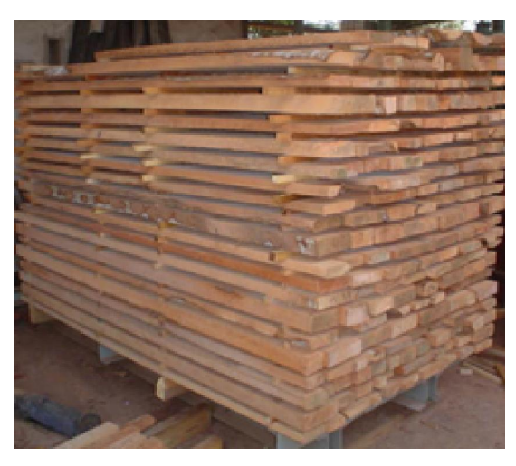
Figure 2: Sawn Cocos nucifera timber stacked to dry